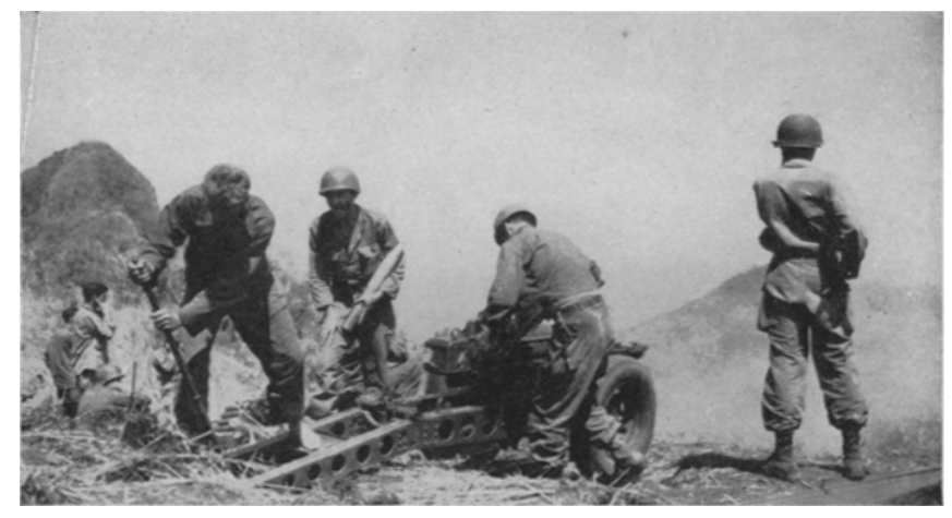
The picture above shows a section of D Battery, 457th Prcht FA Bn, firing point blank at caves on hillside. The gun had been carried on foot, piece by piece, up a slick mountain trail. Below, a Filipino pack party brings ammunition up the side of a mountain near Lipa, Batanges, Luzon, P. I.

Pay-Off. The division commenced its march inland and upland (afoot) and shortly after midnight struck the first dug-in position. Jap machine guns enfiladed the route of advance and threw lead all over the place, while mortars dropped their hollow-cracking shells